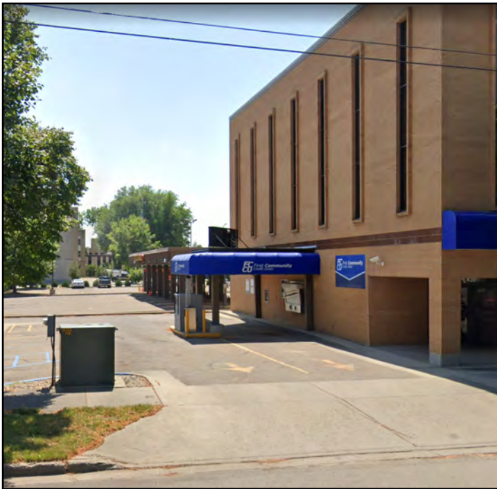
Drive-thru - East side of Building