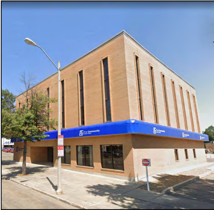
View from N 5th Street