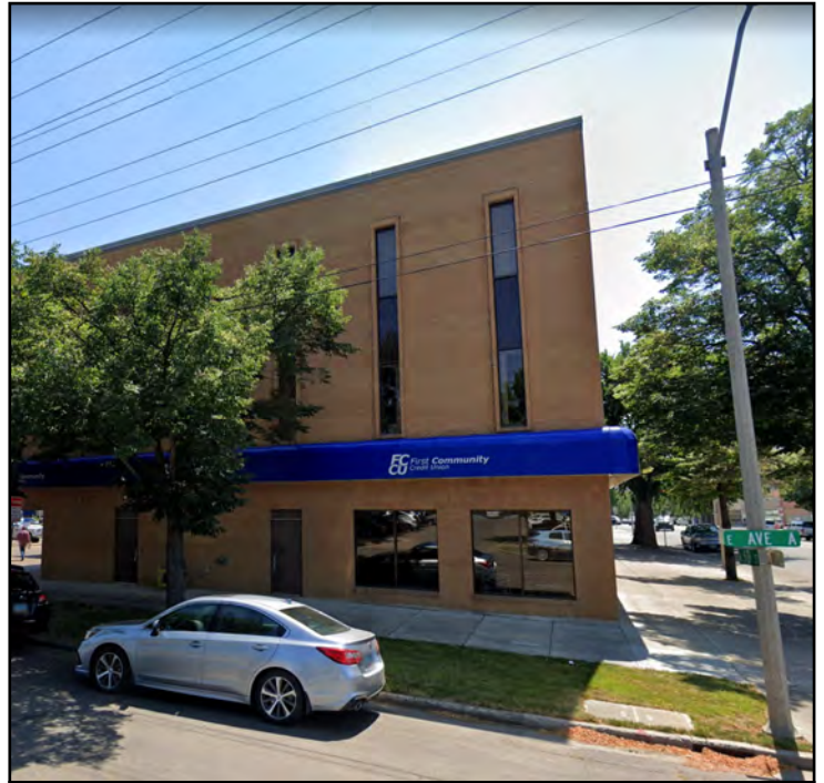
View from E Avenue A